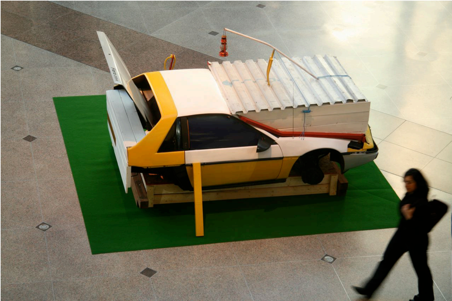
One of three sculptures at Pendulum Gallery